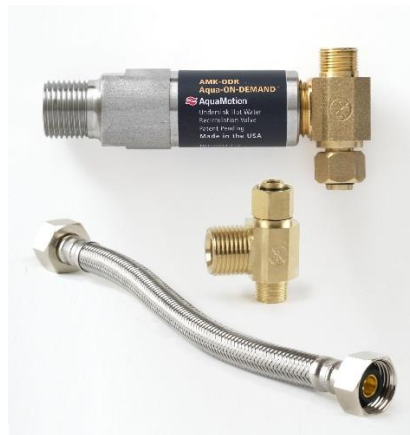
Components for Under Sink Installation